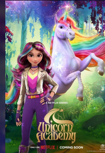
Unicorn Academy (Book Adaptation)